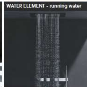
WATER ELEMENT - running water