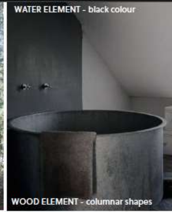
WATER ELEMENT - black colour