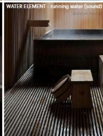
WATER ELEMENT - running water (sound)