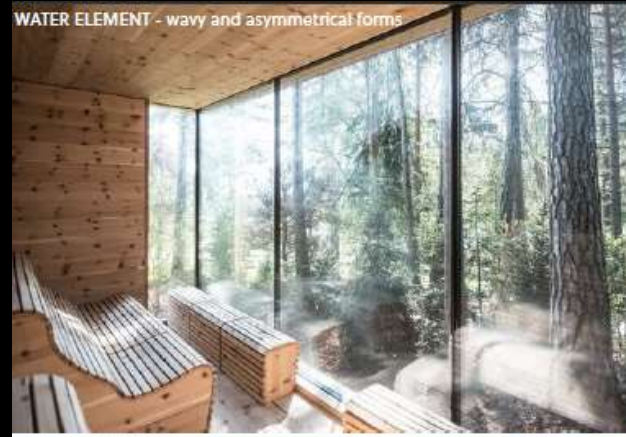
WATER ELEMENT - wavy and asymmetrical forms