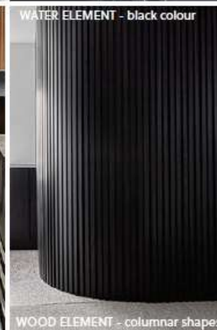
WATER ELEMENT - black colour