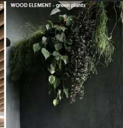
WOOD ELEMENT - green plants