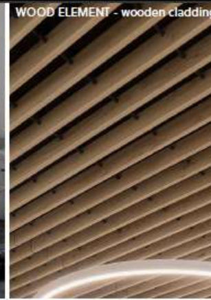
WOOD ELEMENT - wooden cladding