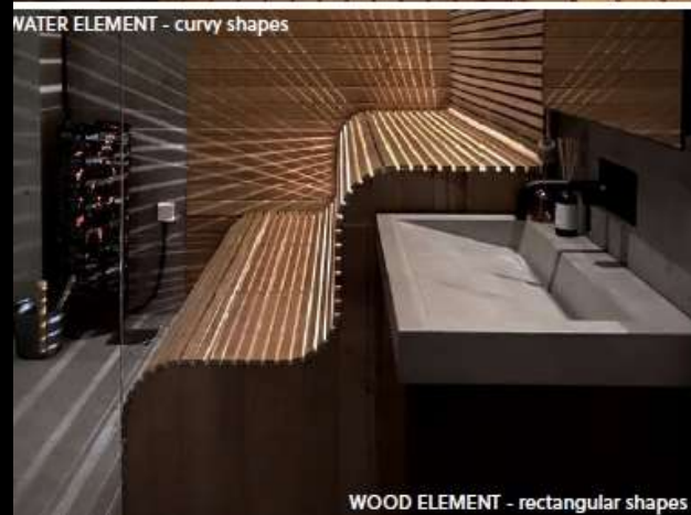
WATER ELEMENT - curvy shapes