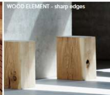
WOOD ELEMENT - sharp edges