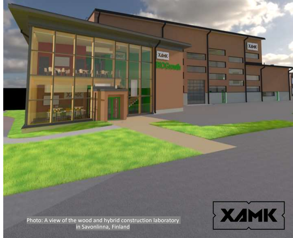
Photo: A view of the wood and hybrid construction laboratory in Savonlinna, Finland

We are looking for partners to develop wood and hybrid intermediate floors!